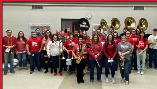
30 Houston band alumni from the graduating years of 1991-2023 joined the HS Pep Band on February 3, for a spectacular combined performance!

As our Wildcat basketball schedule finishes up and our teams head into tournament play, I would like to wish each of our basketball teams the best of luck. And finally, good luck to our Spring sports as they begin the 2024 season.