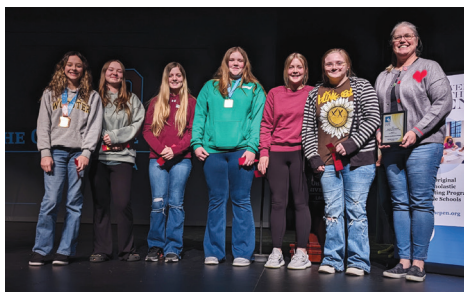
Seventh grade team.