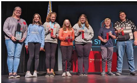
Eighth grade team.